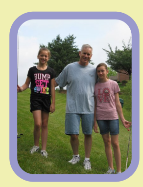
The Lask girls Dragged out of bed by Dad