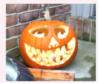
Rakesh and Santosh Gupta 137 Eastwick Ct.

Sorry for the delay the publishing the results of the annual Beggar's Night pumpkin carving contest. There were some very unique entries this year, and I appreciate the widespread participation - especially since the weather was terrible!