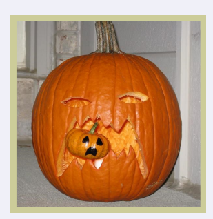
Scariest The Caltabellottas