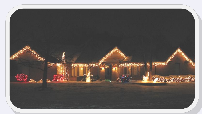
171 Babington Ct.

Driving through our neighborhood at night, I'm impressed by the number of homeowners who braved the exceptionally cold and snowy weather to decorate their homes for the holidays! So many of the houses are beautifully lit. Below are a few of this year's standouts: