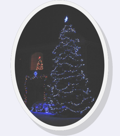
This oversized tree makes me smile every time I pass. Joel Greenleaf braved a frigid day, but the results were worth the frostbite!

LOOKING FOR COUNTY PROPERTY RECORDS OR SCHOOL REPORT CARDS? FIND LINKS TO ALL THE COMMUNITY INFORMATION YOU NEED AT RHONDACHAMBAL.COM. CHECK IT OUT TODAY!