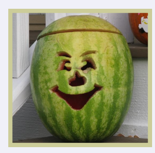
Most Creative The Mayers

Thank you to everyone who participated in the pumpkin carving contest on Beggar's Night! The competition was stiff again this year, but the following jack-o-lanterns took top honors: