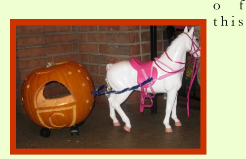
MOST CREATIVE Amelia Leonard